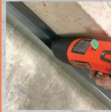
DEEP LEG TRACK