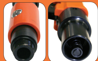
TOOL/POLE CONNECTION The new poles have an internal rod to trigger activation of the Viper4

*Telescoping poles are NOT available for the VIPER4.