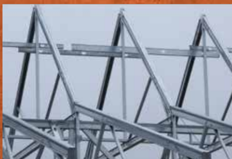
Light Gauge Steel Framing