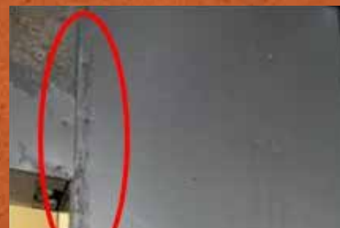
Sheet Metal to Framing