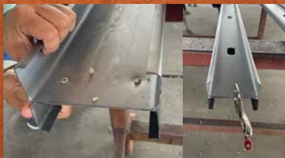
Fastening Steel Frames