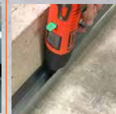
DEEP LEG TRACK