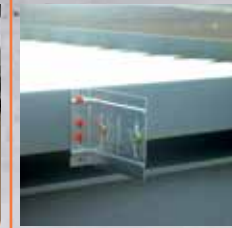
EXTERIOR CLADDING CLIPS